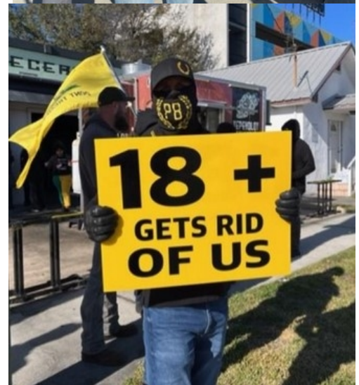
TCCR Staff Screenshots