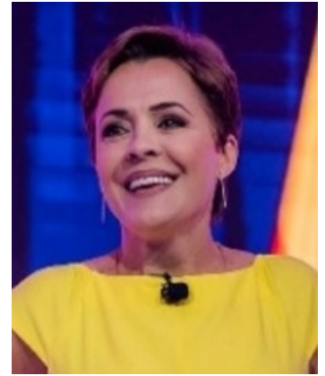
TCCR Staff Screenshot

In Arizona we have a Patriot who is fighting on. Kari Lake has refused to concede and has initiated legal proceedings in an attempt to expose the fraud. Donald J. Trump did the same in 2020. Unfortunately most Republicans just concede. The Alaskan theft is a little different. It actually occurred before the 2022 election.