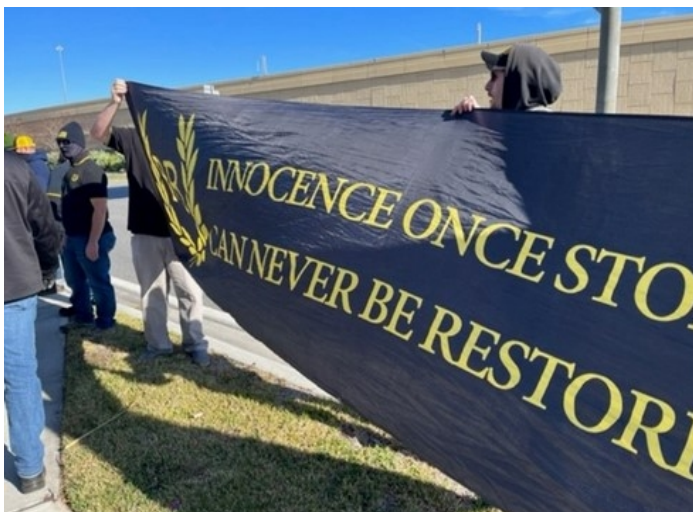
TCCR Staff Screenshot

ABC's First Coast News has reported that the Proud Boys are listed as an extremist and violent hate group by the Southern Poverty Law Center (SPLC). According to SATP members the SPLC could hardly qualify as an authority. During demonstrations in Saint Augustine SPLC observers would accompany Communist groups such as BLM, Occupiers and the New Black Panther Party. The SPLC was there to protect the Communist groups from the American public from a legal perspective.